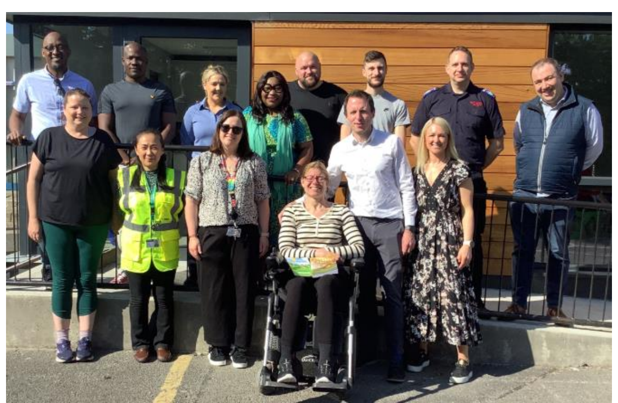
Volunteers at Parent Association Career Day 2024

If you would like to take part or learn more, please get in touch – we'd love to hear from you.