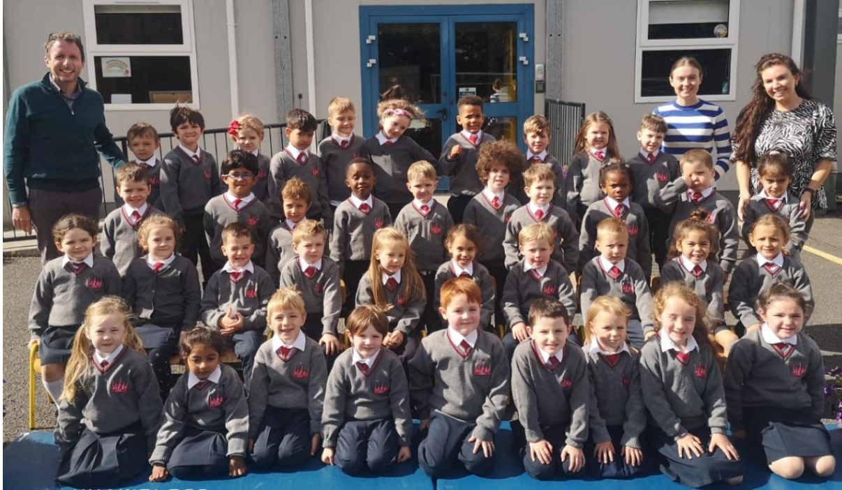
Welcome to the Junior Infant class of September 2022