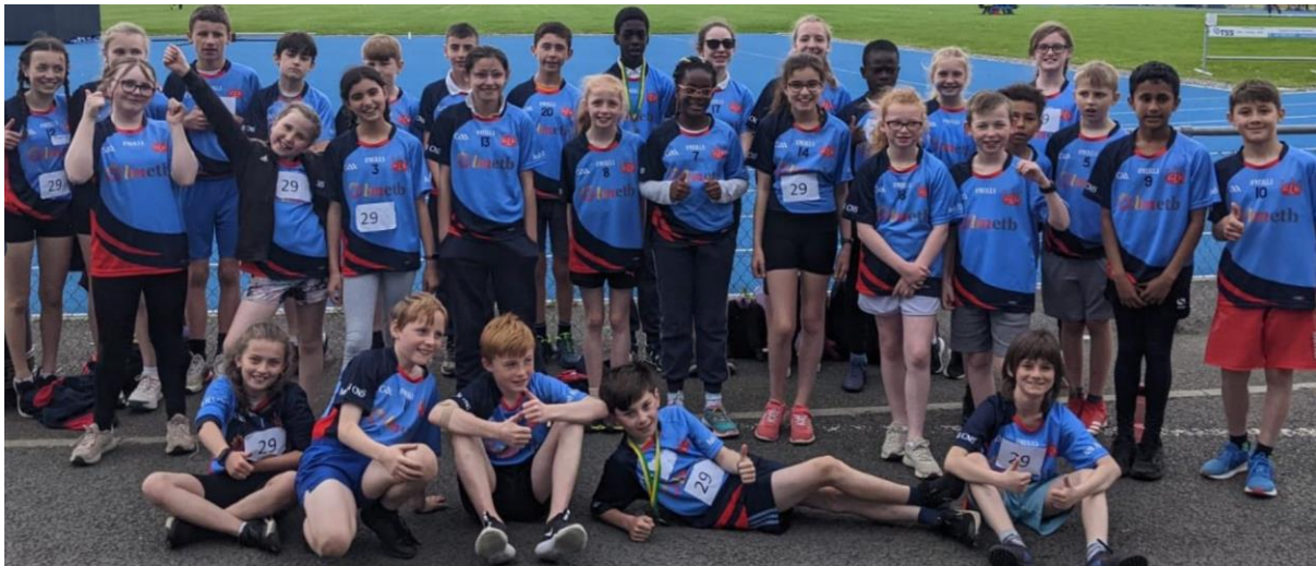
A throwback to our athletes representing Ard Rí at Claremont Stadium