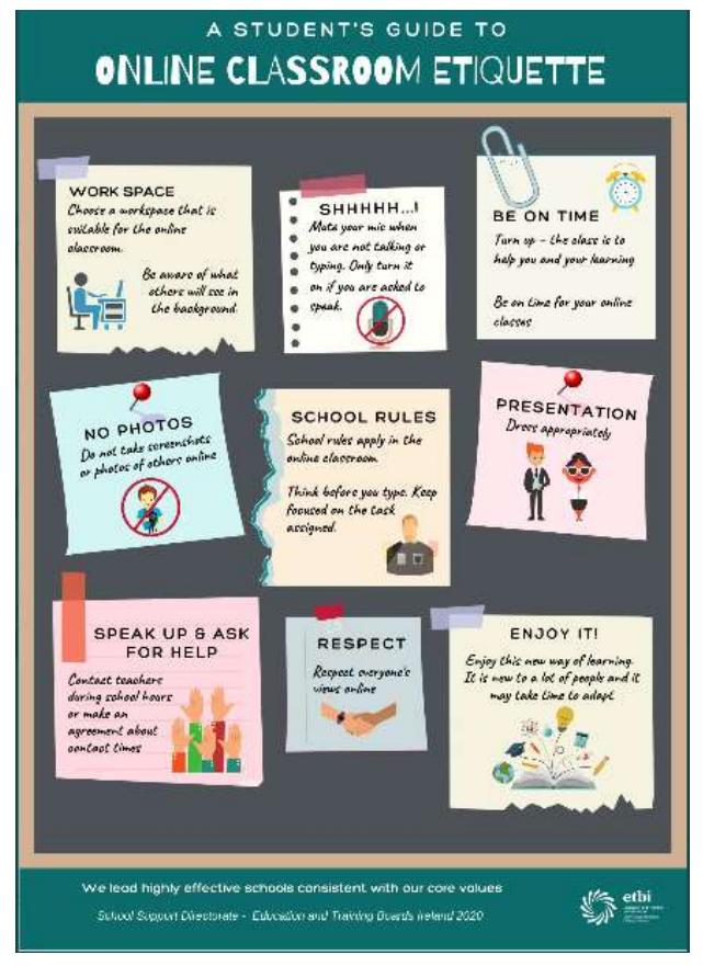
This might be a little bit blurry- Apologies!!